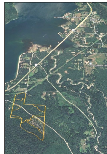
Wildfire Risk Reduction site for Burton, outlined in orange.

Watch for bulletins on the FB Community Page, and on the Burtonbc.ca website and in the next issue of Burton Busy Beeline.