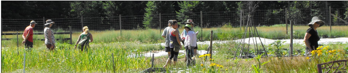
Photos: Volunteers in the Busy Bee Garden, The Busy Bee Shed, Veggies, and Hilling the Community Potato Patch